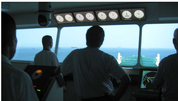
Training facilities tour, Ship Maneuvering Simulator.

In the tours of the facilities, we were impressed that the view from the bridge of a tanker passing through the Akashi Strait was displayed in a realistic manner depending on the time of day, wind speed, and rain fall on the screen of the Ship Maneuvering Simulator.