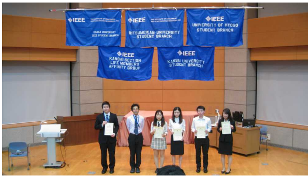
The 16th SB English Presentation Competition.

The awards were presented to the two excellent speakers this year.