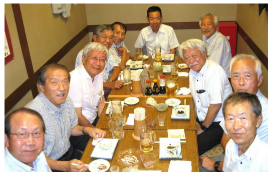
A get-together with the speaker in izakaya near Ashiya Station.