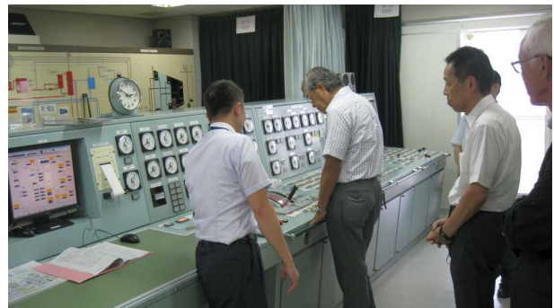
Training facilities tour, Engine Room Simulator.

All the simulators are very well made and are utilized for training for not only domestic candidate navigation officers for the certification but also for overseas teaching staffs.