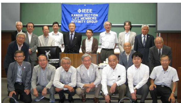
Commemorative photo at the lecture theater.

The reason for this cruise trip was that he wanted to go before the Antarctic