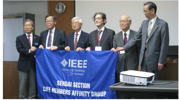
Commemorative photo of the establishment of LMAG Sendai.