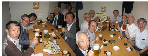
A social gathering was held after the salon as usual in nearby Japanese style pub.