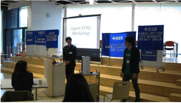
SYWL Workshop 2019 in Sendai.