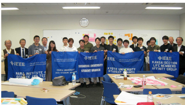
SB's Brainstorming Workshop and Contest.

We supported the event by sending a facilitator (as well as a lecturer) to the workshop and sending advisory participants to the contest.