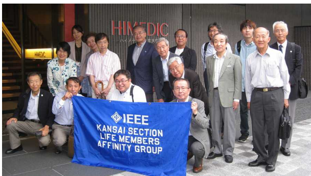
Commemorative photo at the entrance of HIMEDIC Bldg.