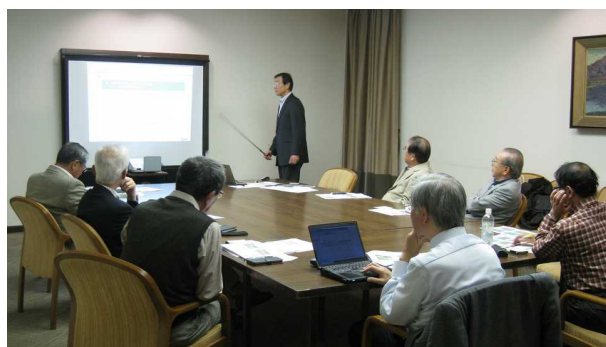
A scene from the Golf Salon.

He explained mechanics, dynamic property, and methods for measurement and evaluation of golf clubs.