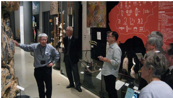
Minpaku museum tour, Oceania Block.

example of his research on information transfer in the Aboriginal Australians' society through fieldwork he did in Australia. The culture of Aboriginal Australians' society based on hunting and gathering used to be materially modest and spiritually rich in its non-literate society. Information transfer in a non-literate society, in other words an oral