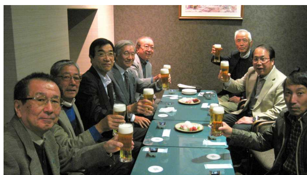
The salon was followed by a social gathering in the tea and bar room of the Sumitomo Club.