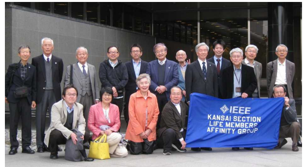
Group photo in front of the Main Exhibition Bldg.